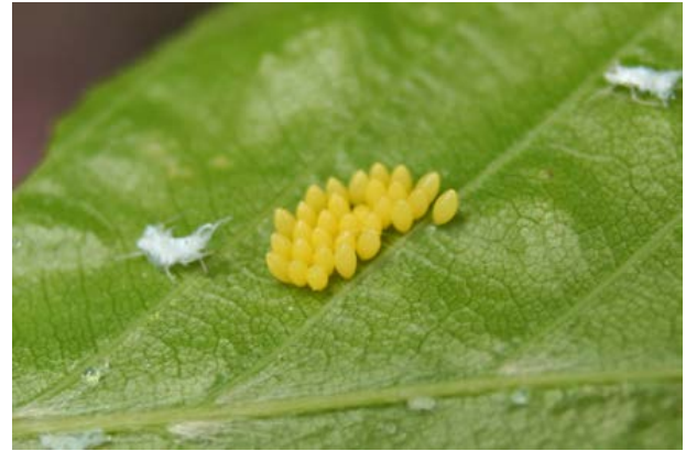
Figure 2. Multicolored Asian lady beetle eggs.

The adults emerge from their protected overwintering sites in the spring to lay eggs (Figure 2). The oval shaped eggs are yellow and typically laid in clusters of about 20 on the underside of leaves or on twigs. Egg clusters are often found deposited in and around high populations of aphids and other soft-bodied insects, which are favorite foods of MALB. Eggs hatch in 3 to 5 days.