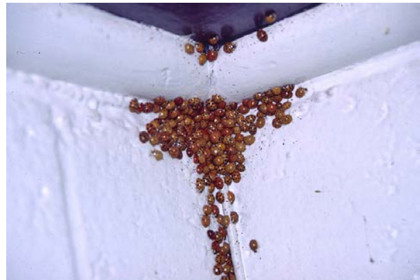
Figure 6. Multicolored Asian lady beetle cluster in a home.