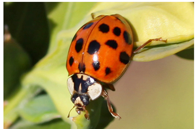
Figure 1. Multicolored Asian lady beetle adult.

The multicolored Asian lady beetle (MALB) (Figure 1) is native to Asia, where it is an important predator that feeds on aphids and other soft-bodied insects that dwell in trees. Exactly how MALB made its way to North America remains shrouded in controversy. There are several reports that this species was accidentally brought on ships to various ports, notably New Orleans and Seattle. However, it is well documented that MALB was also intentionally imported from Russia, Japan, Korea, and elsewhere in the Orient and released in a number of U.S. states and Nova Scotia, Canada, as part of USDA biological control programs to manage insect pests of trees. The rationale was that native species of lady beetles are not particularly effective in controlling tree-feeding aphids and scale insects. MALB release programs were eventually halted based on consistent failures to recapture beetles, which suggested that MALB was not surviving in the United States.