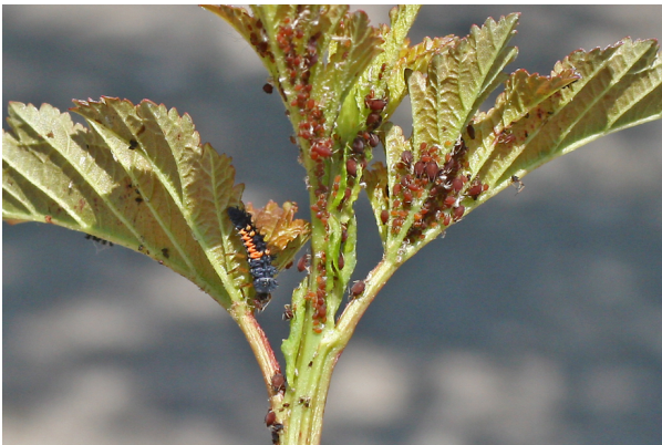
Figure 5. Multicolored Asian lady beetle larva eating aphids.

Unfortunately, MALB also has several bad habits. Their negative behavior and impacts can be separated into four general categories: interior pest; outdoor nuisance pest; fruit and fruit products pest; and competitor to other predators including native lady beetles.